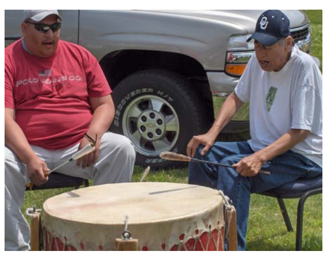
Native American drummers perform at the NE District meeting