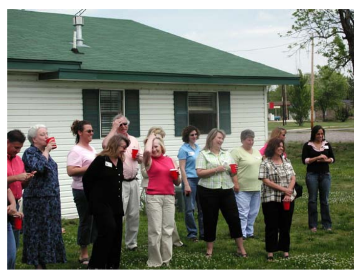
NE District members enjoy the Native American dance performance