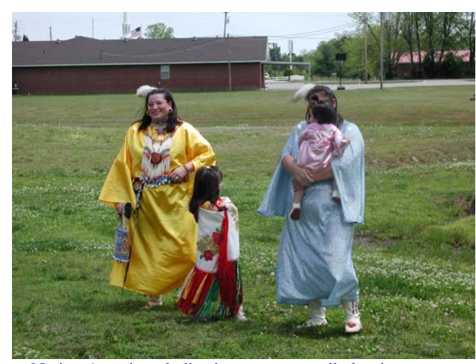
Native American ladies in customary tribal attire