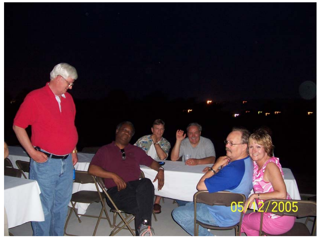
Members of the Tax Commission and of the SE District relax at the Mask residence