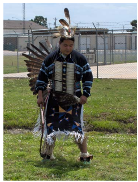
A Native American dancer performs