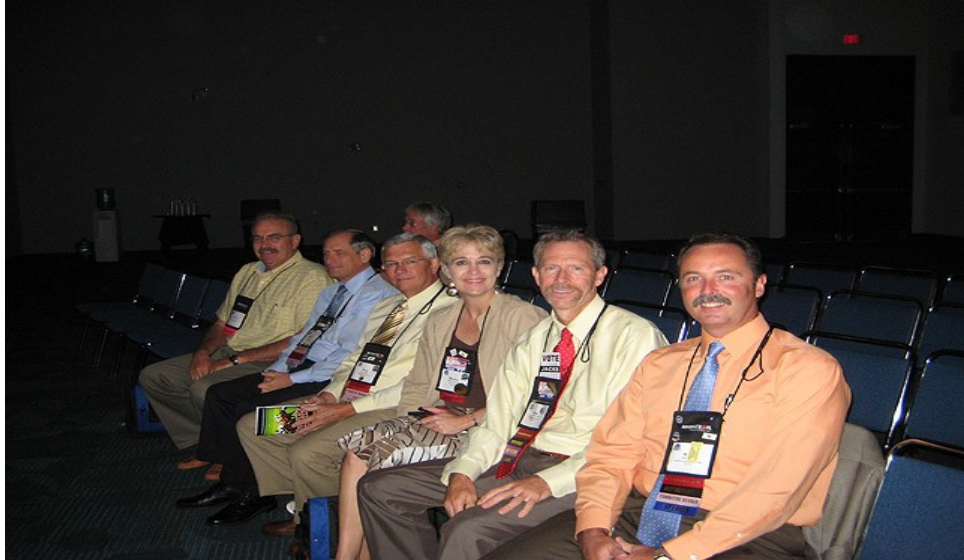
(Left) Opening session at IAAO conference in Louisville, Kentucky.